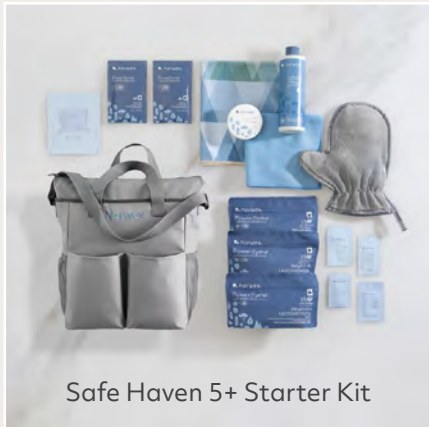
Safe Haven 5+ Starter Kit

Ready to help others live cleaner, safer, better?